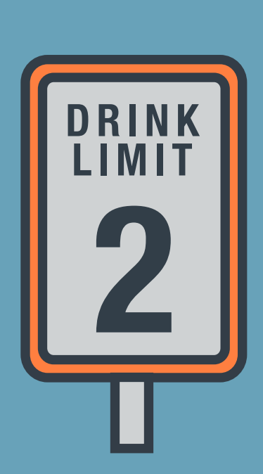
set a limit