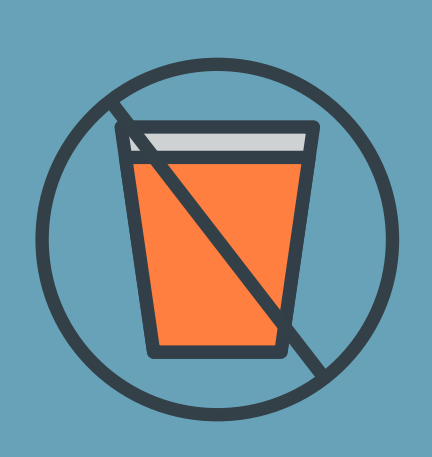
don't do shots